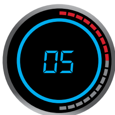
50%: Indicating lights in grey