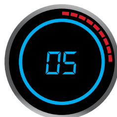
25%: Indicating lights in red