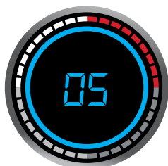
100%: Indicating lights in white