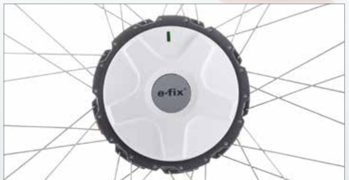
Compact, light, powerful: the e-fix drive unit