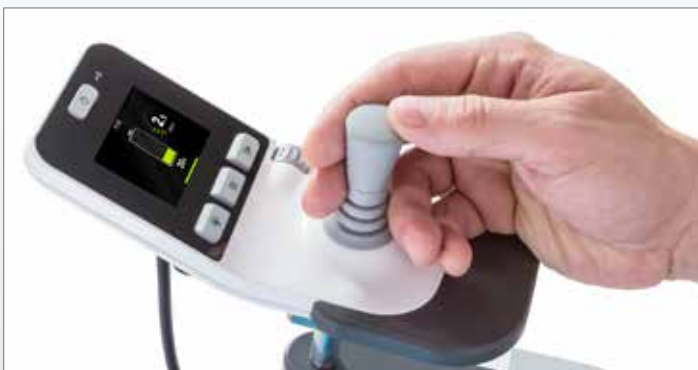
Informative colour display and user-friendly control elements