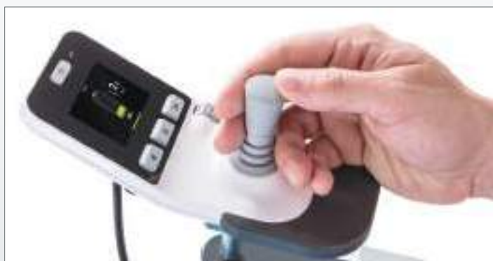
Informative colour display and user-friendly control elements