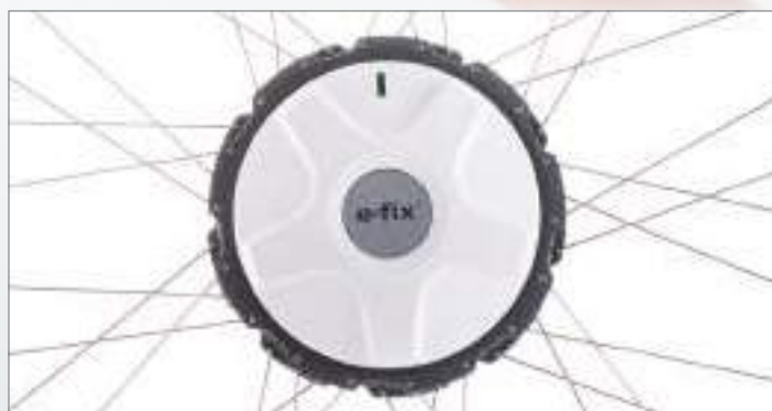
Compact, light, powerful: the e-fix drive unit