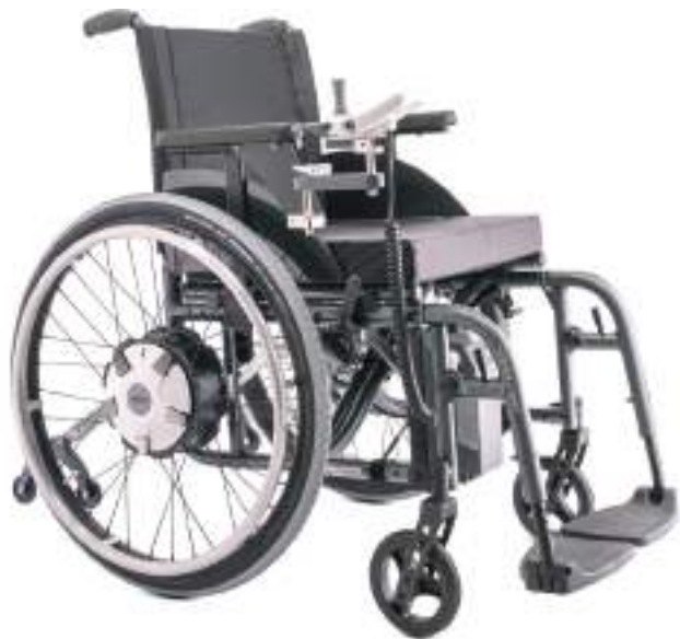
e-fix E36: powerful drive wheels with more power (optional)