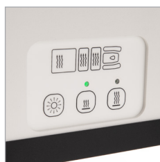
Table controls regulate both heating and lighting functions