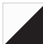
Black/Ecru (x = 10)