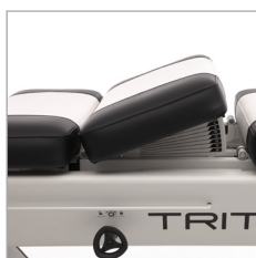
Pelvic tilt section (0° to 20°)