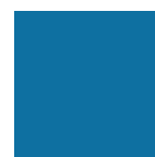
Blue (x = 02)