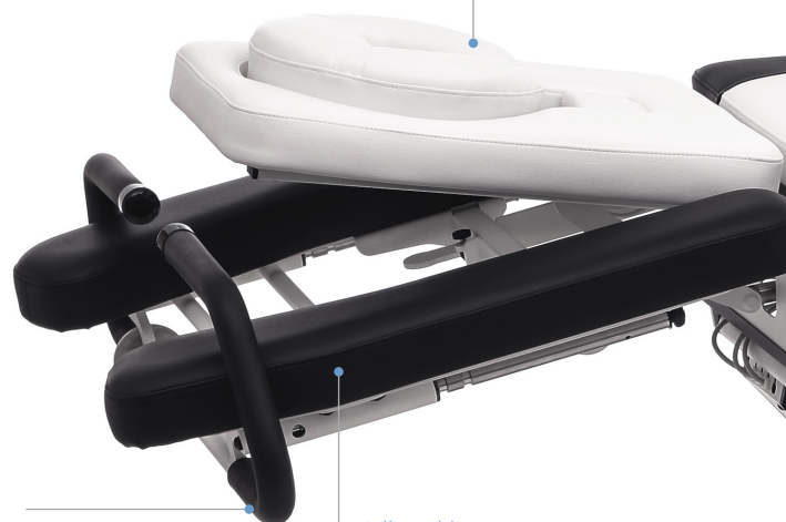
Foldaway grab bar