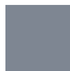
Graphite Grey (x = 07)