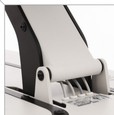
Integrated cable and power cord system