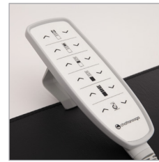
Intuitive remote hand control for all moving parts